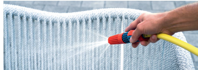
FASE - PHASE 2