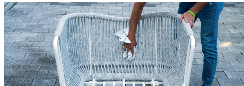
FASE - PHASE 3