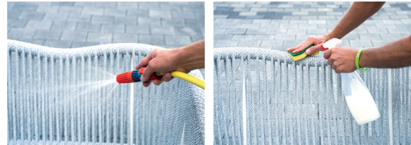
FASE - PHASE 1