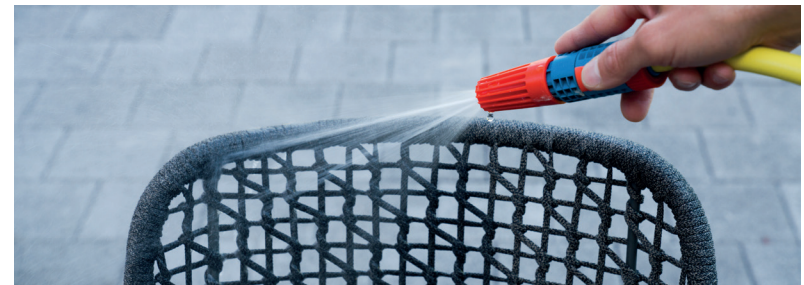
FASE - PHASE 2