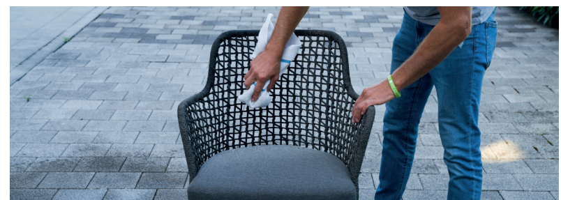
FASE - PHASE 3