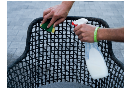
FASE - PHASE 1