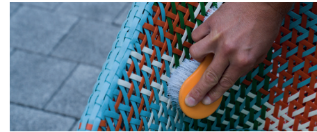
FASE - PHASE 2