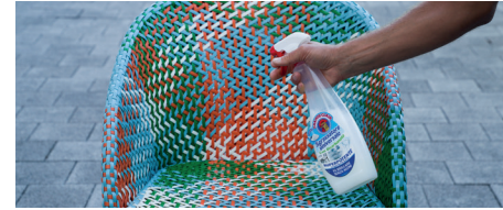
FASE - PHASE 1