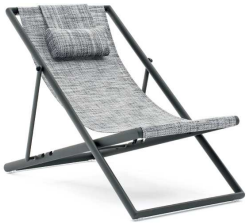
Sdraio pieghevole foldable Deckchair