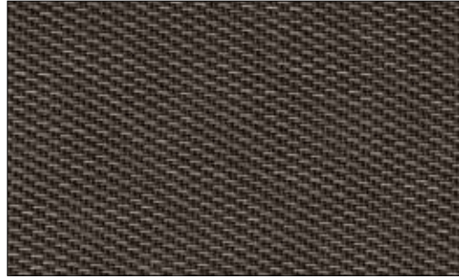
TEXTURE GREY BROWN